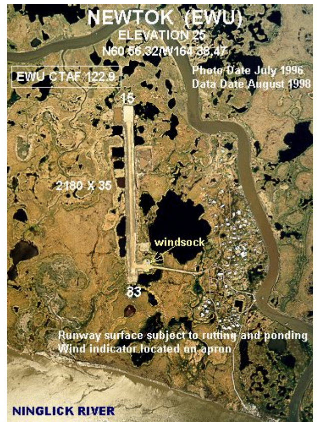
Photo 2.1: Existing Newtok Airport and community