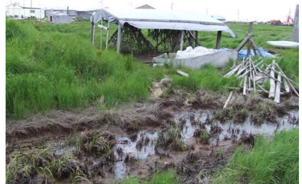
Photo 1.1: Sewage by fish racks after flood waters overflowed the sewage lagoon

The village is under threat of erosion by the Ninglick River. As of 2005, the barge and landfill areas have eroded away. As discussed in the Newtok Background for Relocation Report (ASCG, 2004), the erosion is projected to impact the village structures by 2015 and the airport by 2022.