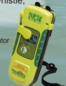
Personal Locator Beacon

A cold water immersion event is a fight for survival .