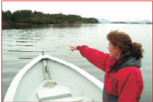
Designate a lookout while launching a rescue effort, so they can keep eyes on any victim falling overboard while the boat driver maneuvers closer.