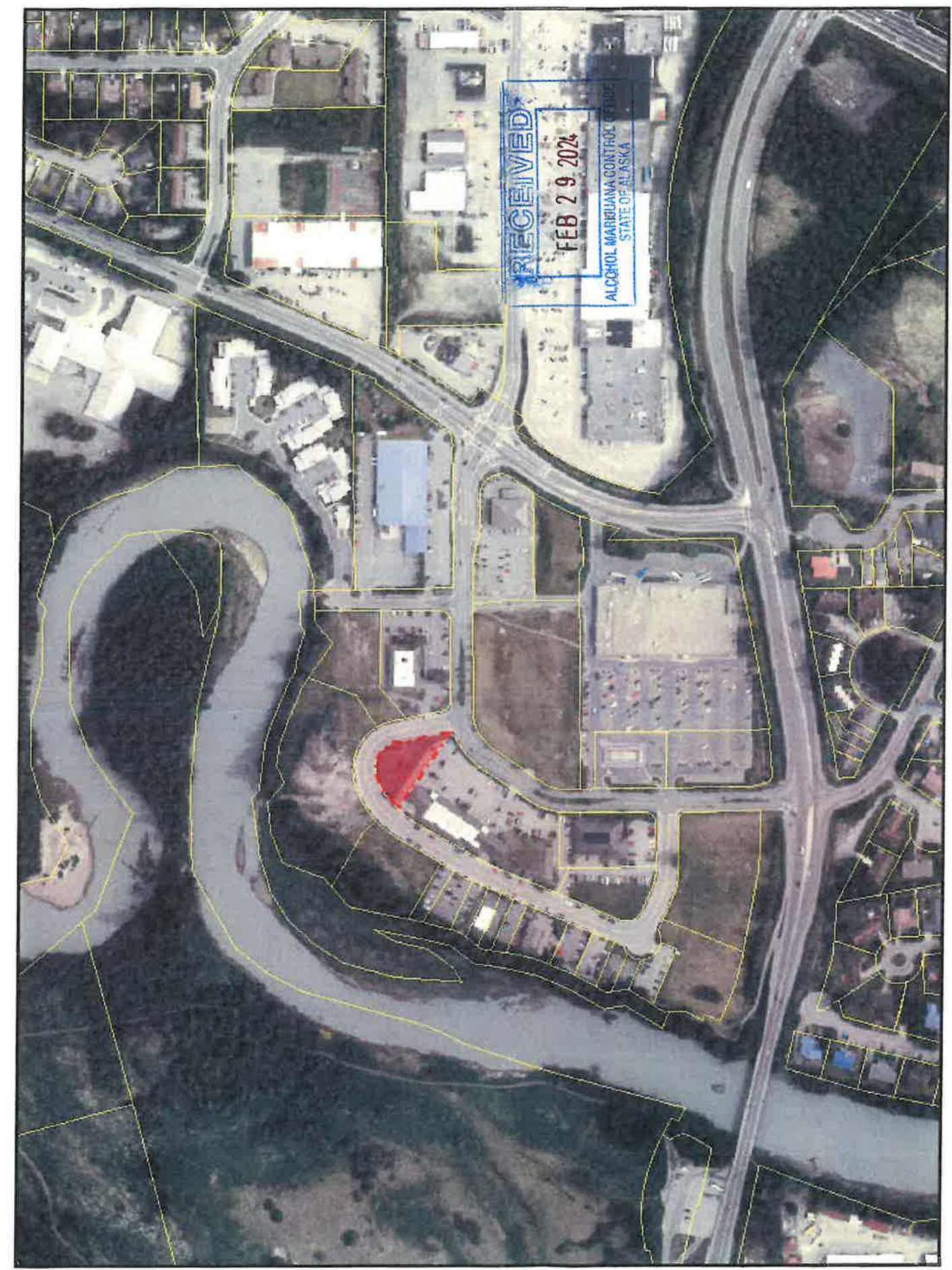
The City and Borough of Juneau is not responsible and shall not be liable to the user for damages of any land arising out of the use of data or information provided by the City and Borough of Juneau is PROVIDED 148 is: WITHOUT WARRANTY OF ANY KIND, ETHER EGRESSED OR IMPLIED, INCLUDING, BUT NOT LIMITED TO, THE MALLIED WARRANTIES OF MERCHANTABILITY AND FITNESS FOR A FARTICULAR PURPOSE. Data or information provided by the City Borough of Juneau shall be used and relied upon only at the user's sole risk, and the user agrees to indemnify and hold hamless the City Borough of Juneau. Its officials, officers and employees from any fishing arising out of the user of the data/information provided. NOT FOR ENDINEERING PURPOSES.