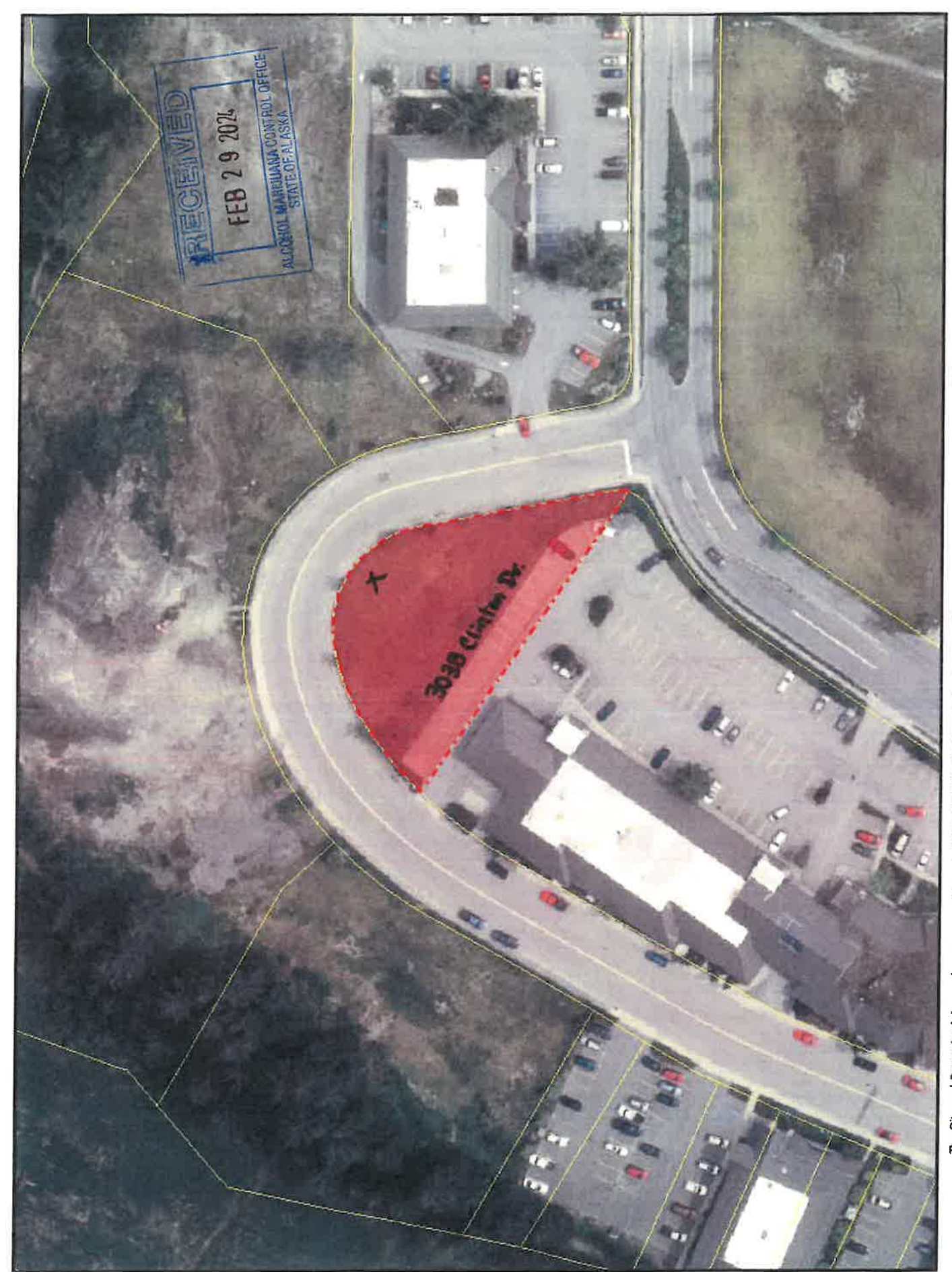
The City and Borough of Juneau is not responsible and shall not be liable to the user for damages of any kind arising out of the use of data or information, its use, or the results obtained from its use. ANY DATA OR INFORMATION PROVIDED BY THE City Borough of Juneau IS PROVIDED "AS IS" WITHOUT WARRANTY OF ANY KIND, EITHER EGPRESSED OR IMPLIED, INCLUDING, BUT NOT LIMITED TO, THE IMPLIED WARRANTIES OF MERCHANTABILITY AND FITNESS FOR A PARTICULAR PURPOSE. Data or information provided by the City Borough of Juneau shall be used and relied upon only at the user's sole risk, and the user agrees to indemnify and hold harmless the City Borough of Juneau and inability anished out of the use of the damagin provided. NOT FOR ENRING PURPOSE.